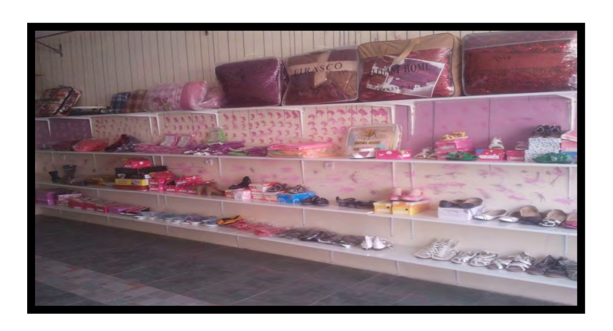
The Shoes Store