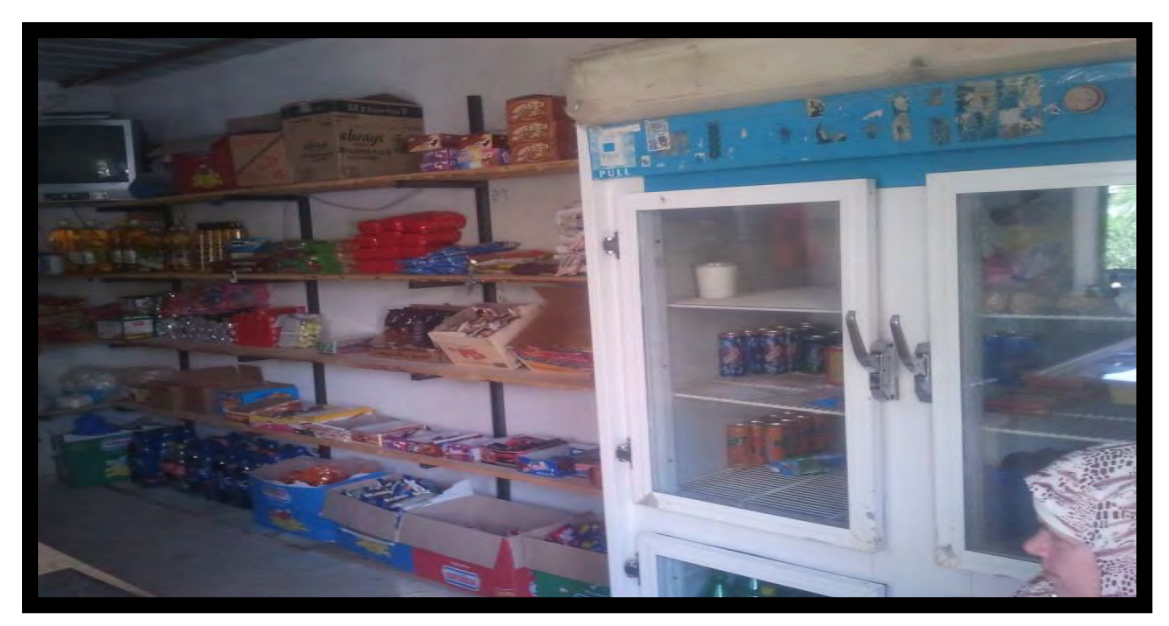
The Mini Market